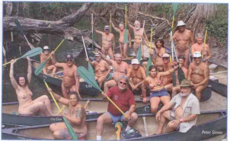
CANUDERS GET ready to explore the Loxahatchee River.